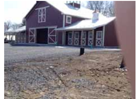
Dutchess County Fair - New Admissions Gate