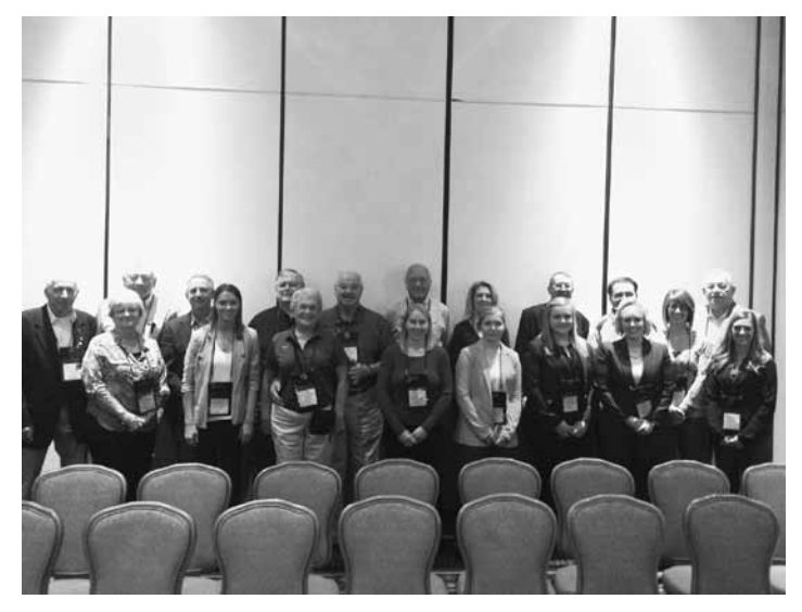
Delegates from New York Fairs attend the Zone 1 meeting at the annual IAFE Convention and Trade Show.