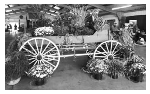
Flower display in the NY products building at the Schaghticoke Fair.