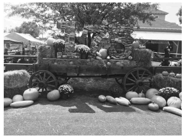
175th Columbia County Fair in Chatham was held September 2-7

Stop by the Registration Booth for details and to sign up. It's going to be fun!