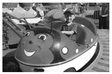
A ride provided by Playland Amusements at the Seneca County Fair