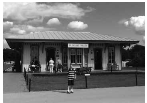
Pleasant Valley Railroad Station at the Dutchess County Fair