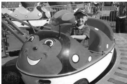
A ride provided by Playland Amusements at the Seneca County Fair