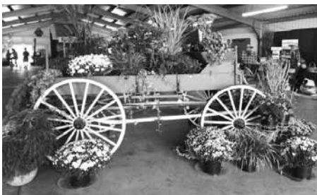
Flower display in the NY products building at the Schaghticoke Fair.