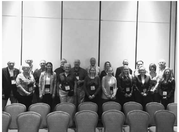
Delegates from New York Fairs attend the Zone 1 meeting at the annual IAFE Convention and Trade Show.