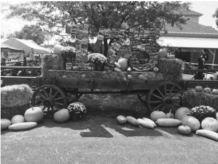
175th Columbia County Fair in Chatham was held September 2-7