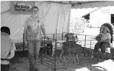
Altamont Fair held agricultural demonstrations daily. Fair was held August 16-21. Farm Machinery, Circus, One Room Schoolhouse, Blacksmith Shop, Carriage and New World Dutch Barn were some of the museums offering a window to the past